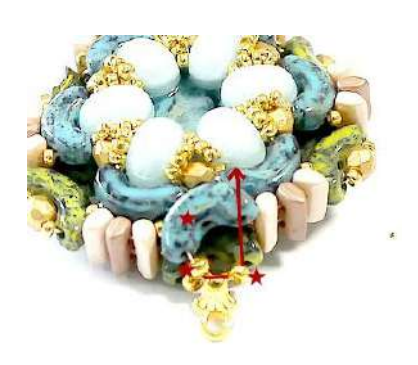
22) Place 1 Arcos (first color) 1 R11, pass through the Cymbal to zip and 1 R11 and place yourself in the Arcos HERE.