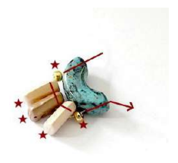
1) Place 1 Arcos, 1 R15, 3 Piros and 1 R15 in the Arcos.