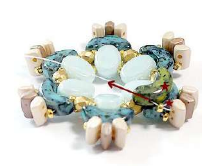
10) Place 1 R15 and 1 Arcos second color!