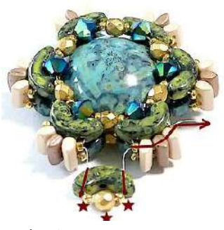
18) Place 1 Arcos (same color), 1 R15, 1 F3 and 1 R15 and place yourself HERE in the R15 after the Piros. Do the whole row. Except the last one!