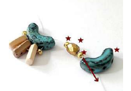
2) Place 1 R15, 1 F3, 1 R15 and 1 Arcos.