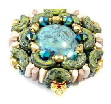
25) Consolidate at the Cymbal and close your wire.