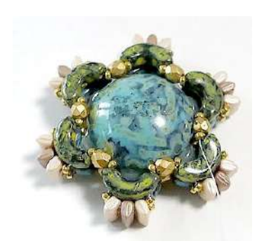
15) Place your cabochon