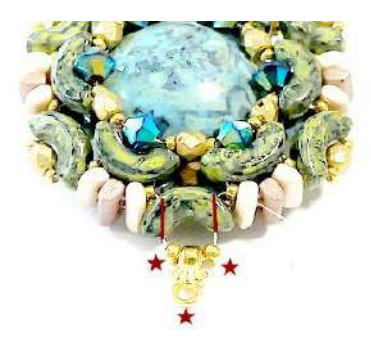
20) Place your last Arcos, then 1 R11, 1 Cymbal and 1 R11.