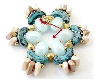
8) Place 3 R15 in the R15 between the Samos HERE. Repeat steps 7 and 8 for the whole row.