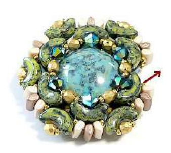
19) You get this 😊