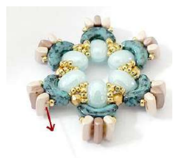
9) You get this \mathfrak{S} . Place yourself HERE in the second hole of the Piros. Then turn over your work.