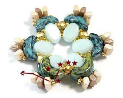
11) Then place 1 R15, 1 F3 and 1 R15 and 1 Arcos on the Arcos on the first side (one on top of the other).