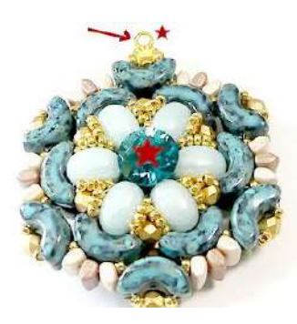
26) Glue your 8 mm rhinestone and place your Pendant clasp in the Cymbal.