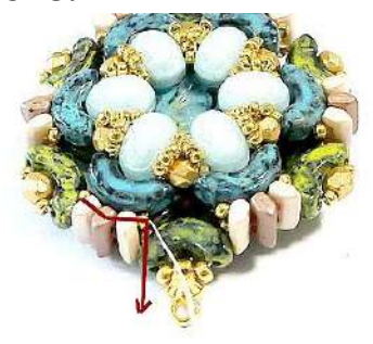
21) Turn your work over and place yourself HERE in R15.