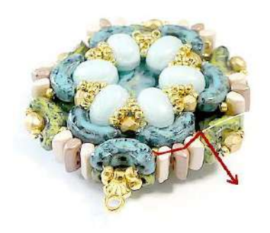
23) You get this 😊 We place ourselves HERE in the R15 after the Piros.