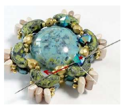
16) Place 1 T4 between each group of beads (R15, F3 and R15).