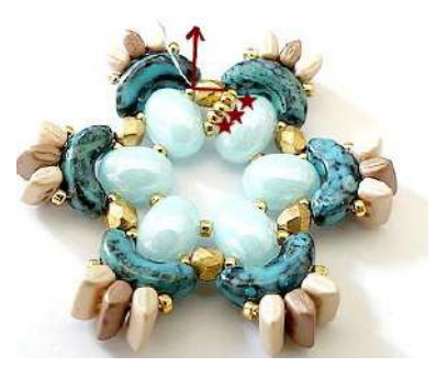
7) Place 3 R15 in the F3.