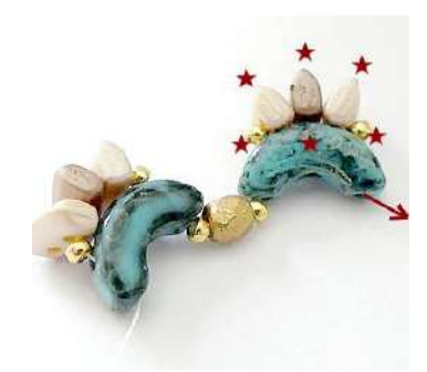
3) Repeat step 1, then alternate steps two with the 6 Arcos.