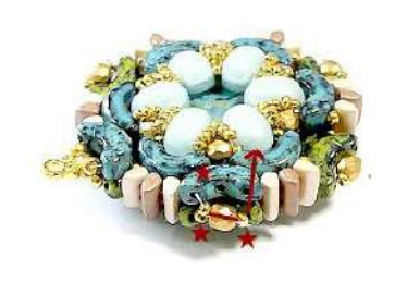
24) Place 1 Arcos and R15 in the existing F3 then 1 R15 in the Arcos. Do the whole row this way.