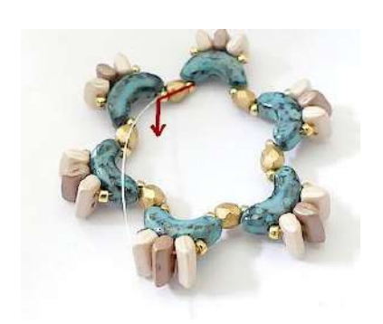
4) You get this Close and place yourself HERE in R15, F3 and R15.