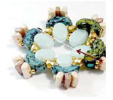
12) Place 1 R15 in the Arcos HERE. Do the whole row, steps 10 to 12.