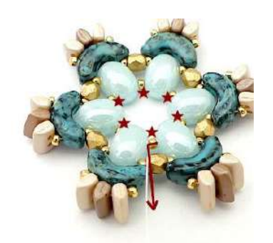
6) Place 1 R15 between each Samos. Place yourself in R15 HERE.